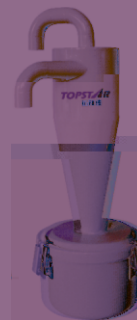
旋风分离器图 Cyclone Separator